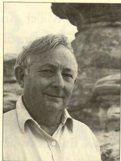
Tony Hillerman has written numerous best-selling detective stories. Robert Redford's production company, Wildwood, has purchased the movie rights to many of Hillerman's books.